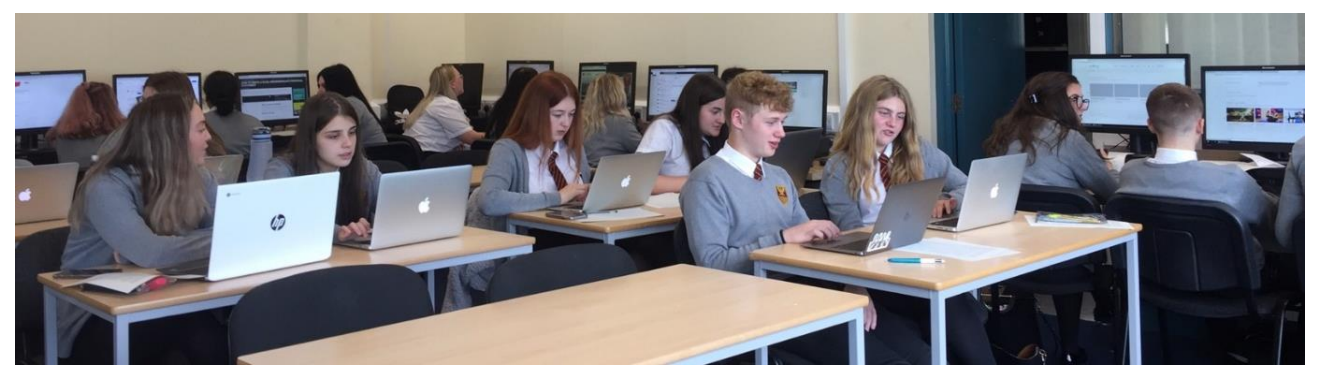
Year 13 students researching university courses and drafting their personal statements.